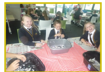
Year 5 at Groundworks recycling