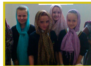
Year 4 at Hartlepool Mosque

Throughout the week a great deal of learning also took place outside of the classroom. Children across the school went on multicultural inspired educational visits to a number of places of worship. The children in the Reception classes visited Sunderland Minster to help develop their understanding of Christian places of worship. The Year 1 children were fascinated on their visit to the Hindu Temple in Middlesbrough and in doing so, brought their studied theme of Hinduism to life. The children in Year 3 and Year 6 studied Sikhism and to enhance their understanding, they visited the Sunderland Gurdwara where they enjoyed experiencing Sikh customs and traditions. In relation to their theme of Islam, Year 4 visited Hartlepool Mosque where they were warmly welcomed and enhanced their knowledge of Muslim worship. The children of Year 5 were fascinated when they visited the Reform Synagogue in Newcastle to further develop their understanding of Judaism. All children thoroughly embraced Multicultural Week with a great respect for cultural differences. A huge well done to everyone involved in the organisation of the week.