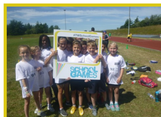
The Quad Athletics event

A group of children took part in the annual Sunderland Schools Dance Festival at The Sunderland Empire. This year's theme was 'Games and Gaming' and the children performed an excellent routine with a Kung Fu twist wearing karate suits. Everyone was very proud of the level of effort that was put into the rehearsals and everyone's hard effort definitely paid off in the final show.