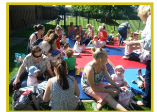
Fun in the Sun at Toddler Group