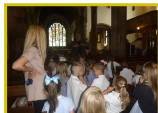
Foundation Stage at Sunderland