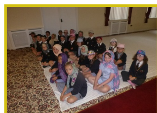
Year 3 at the Gurdwara