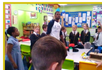
'Yes I Can!' Motivational Session