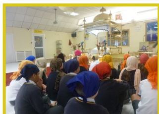
Year 6 at Sunderland Gurdwara