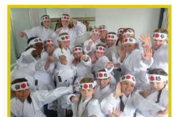
The Dance Festival troupe