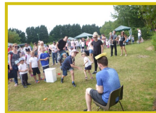
Soak the Teacher at the Fayre

The annual Summer Fayre was a great success. A huge thank you to Friends of Bernard Gilpin who helped to organise the fayre and thank you to parents/carers for your generous contributions. A tremendous amount of time and effort goes into the organisation and all money raised will be used to support activities in school. Thank you also to our friends for organising the summer disco and to our excellent school council DJs for providing the music. The children really enjoyed the beach party theme and many prizes were won for the best dance moves!