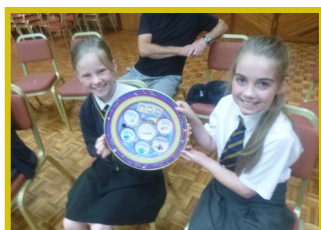
Year 5 at the Reform Synagogue

Throughout the week a great deal of learning also took place outside of the classroom. Children across the school went on multicultural inspired educational visits to a number of places of worship. The children in the Reception classes visited Sunderland Minster to help develop their understanding of Christian places of worship. The Year 1 children were fascinated on their visit to the Hindu Temple in Middlesbrough and in doing so, brought their studied theme of Hinduism to life. The children in Year 3 and Year 6 studied Sikhism and to enhance their understanding, they visited the Sunderland Gurdwara where they enjoyed experiencing Sikh customs and traditions. In relation to their theme of Islam, Year 4 visited Hartlepool Mosque where they were warmly welcomed and enhanced their knowledge of Muslim worship. The children of Year 5 were fascinated when they visited the Reform Synagogue in Newcastle to further develop their understanding of Judaism. All children thoroughly embraced Multicultural Week with a great respect for cultural differences. A huge well done to everyone involved in the organisation of the week.