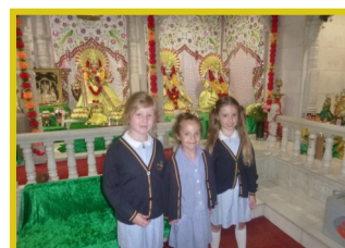
Year 1 at the Hindu Temple