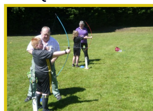
Archery during Sports Week