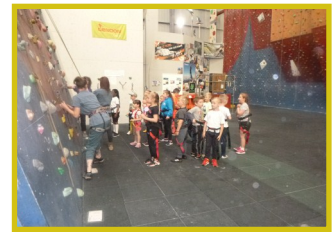
Year 2 at Sunderland Climbing Wall

During Sports Week, all year groups were taken on an off-site visit to a sporting venue to take part in different activities. The visits were thoroughly enjoyed by all and the children displayed great resilience.