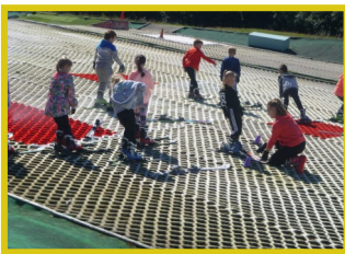
Year 3 at Silksworth Ski Slope

There were many other sporting activities at school for the children to try including archery, judo, kick boxing, futsal, tennis, rugby and many more. Well done to everyone involved for a fantastic week.