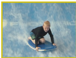
Year 4 surfing at FlowRider