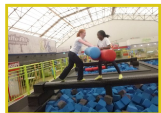
Year 6 at Infinite Air