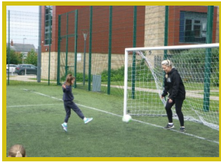
Foundation Stage at Houghton Sports Centre