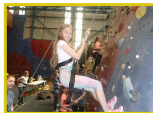
Year 5 at Sunderland Climbing